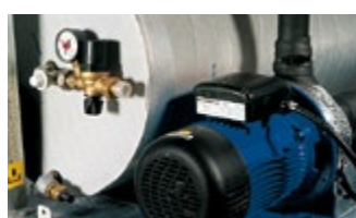
Separate storage and pump module with two pump versions.