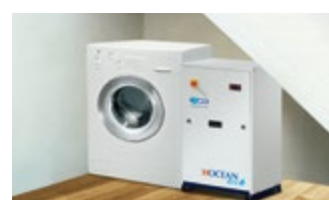
Allows installation in even the most limited spaces.