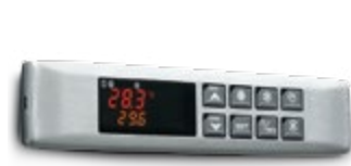
Microprocessor controller with dual icon-based display.